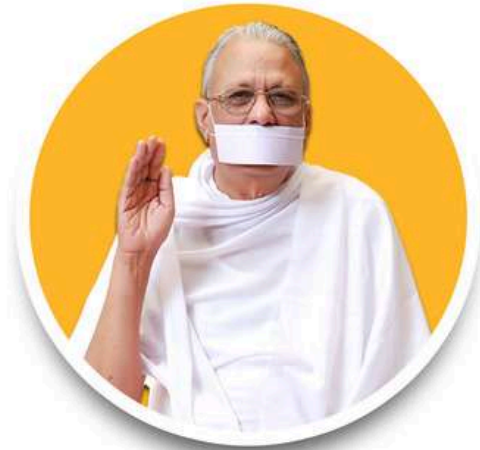
Founder Trustee and Chairman