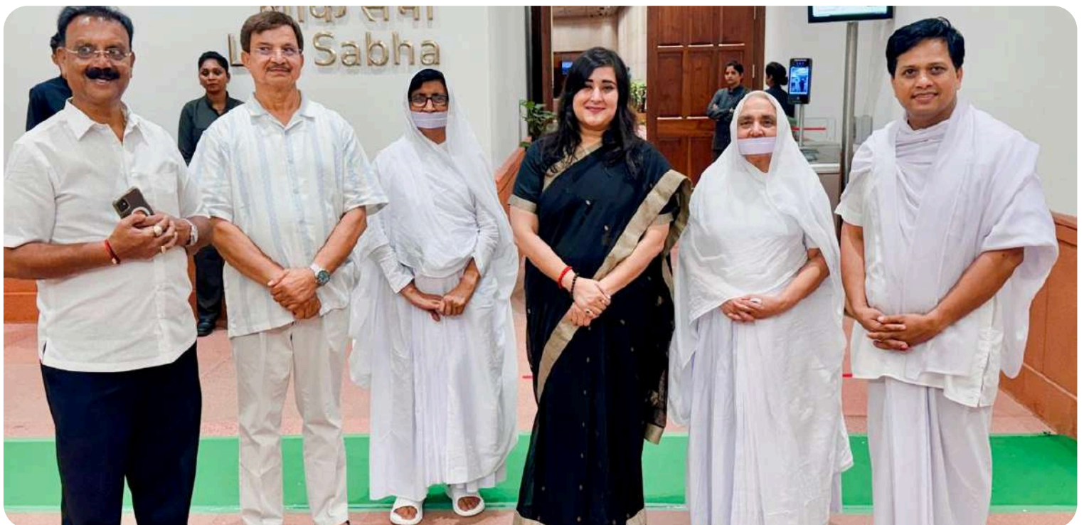
With Member of Parliament Ms. Bansuri Swaraj Ji