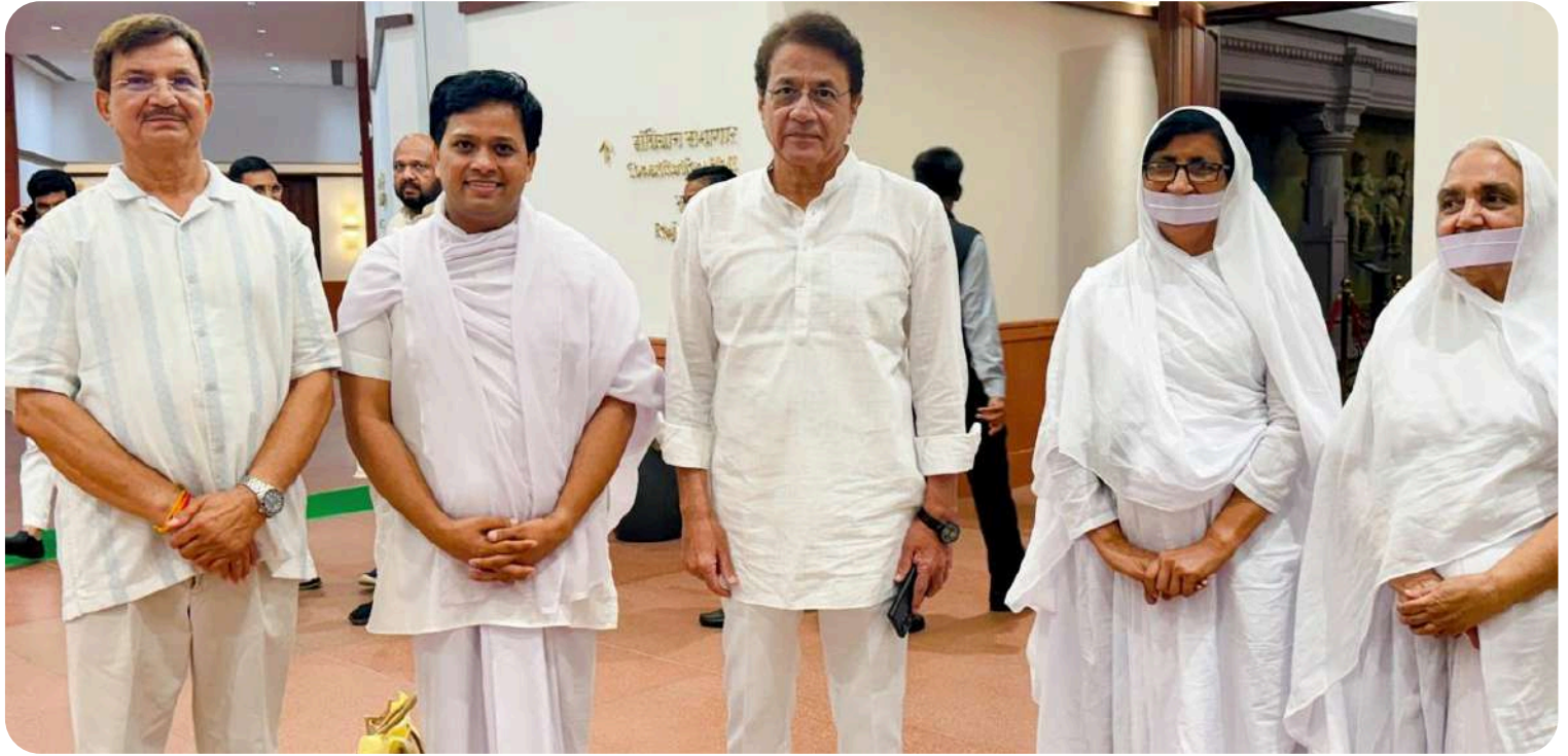
With renowned actor and Member of Parliament Shri Arun Govil Ji

A delegation from the Manav Mandir Mission visited the Parliament of India, where they had the opportunity to meet Shri Arun Govil Ji, the famous actor from 'Ramayan' and now a Member of Parliament, as well as Member of Parliament Bansuri Swaraj Ji. That must have been an inspiring and significant visit.