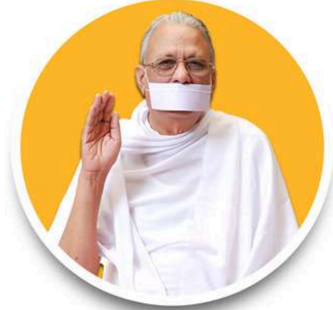
Founder Trustee and Chairman